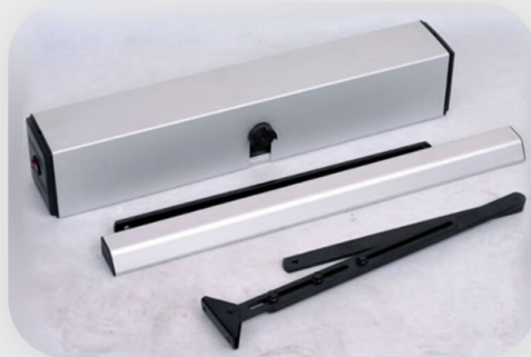
Swing Door Motor

We Supplying a precision range of automatic swing Door in different compact designs, tolerances and are extremely easy to install. These are specifically designed to suit all architectural designs and are provided with self-locking electromechanical operator. Ideally our all automatic swing Door are Affordable and easy to install you can also adjust speed of the door