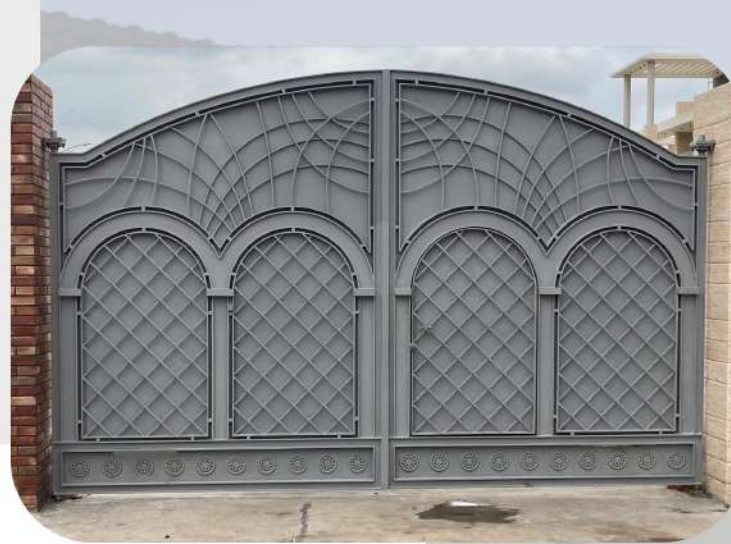
Modern Swing Gate

The automations of Om Automation for the swing gates have been designed in nine different versions, automations for swing, automations for swing with articulated arms and automations for underground swing gates with the relative foundation boxes. All versions have been developed with a modern and strong design and low impact for the aesthetics of the gate.