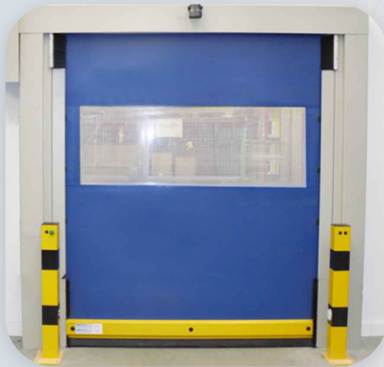
RAPID ROLL UP DOORS

The Om Automation High Speed Roll Up Doors are designed for safe, quick, efficient, and easy operation in any internal busy doorway. The door curtain rolls up at breakneck speed on the shaft, which is directly connected to the high-performance drives