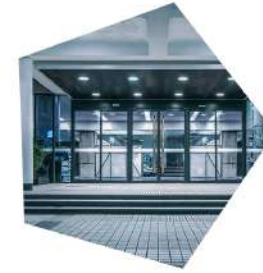
Automatic Glass Door